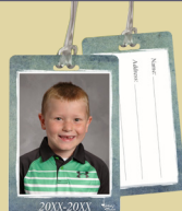
BACKPACK TAG Etiqueta para mochila